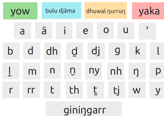
Alphabet Board – Yolḡu Matha